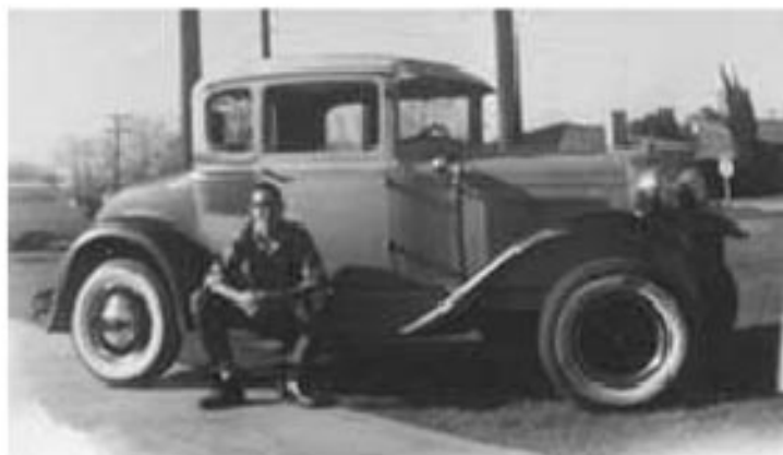
***WHO IS IT? Hint: Both photos are circa 1960 - (Answer: IT'S GORMO!!!)