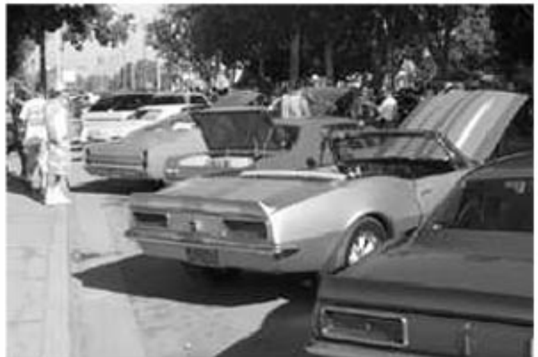
>OFRT rides always draw a crowd

Saturday festivities wound down with the usual ringers, with the OFRT & OTHG policing themselves – even though local law enforcement really wanted to justify their presence by helping. Late evening talk was of shared and individual experiences, with the conversation lasting into the wee hours.