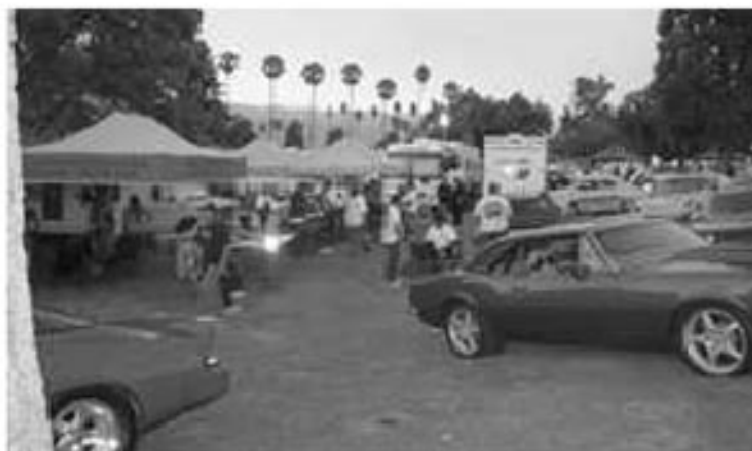
>Camp Asche at Meadowbrook Park

Friday is the official "start" of festivities for Route 66, and by noon the numbers at Camp Asche had swelled to many more than the registered participants. Areas 3-4 designated by those who plan the event were filled, with the availability of "Reserved Spots" garnering rave reviews by those arriving later in the day. Unfortunately, getting to the reserved areas proved difficult at best , with descriptions of experiences quickly deteriorating to "...!@#$$%^&*"